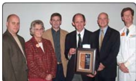
Guests at the 2006 Dr. R. Ben Alley Endowed Lecture Series

The UTGSM and the Department of Oral and Maxillofacial Surgery