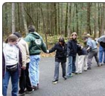
Medicine Department Retreat

The Department of Medicine recently held a retreat entitled "Work-Life Balance." Residents and faculty met October 27-29 at Twin Creeks Trail and stayed over night in cabins overlooking Mount LeConte in the Great Smoky Mountains National Park. The group participated in stress reduction and team building activities with