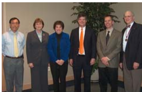
Speakers at the Diabetes Conference

A capacity crowd of physicians, nurses, dietitians and other members of diabetes-management teams attended the March 10, 2007, CME conference,